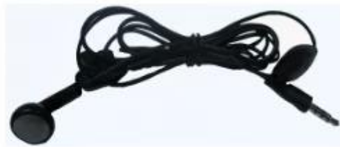
Picture 2: physical map of the headset