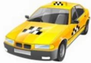
Taxi & Cab