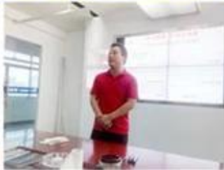
lecturer for Execution