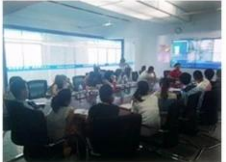
Technical Training For Fast Response to Customer Richmor 锐驰