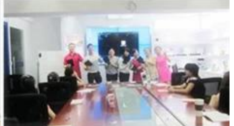
Inner Training after study from Alibaba in July